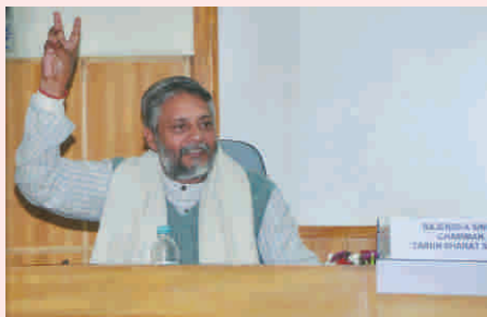
Shri Rajendra Singh addressing the officers at part of the Eminent Speaker Series

Shri Rajendra Singh, Ramon Magsaysay Award winner and an internationally acclaimed name in