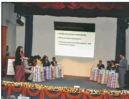
13th All India DAD Quiz in progress