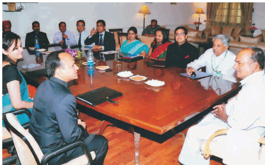
Hon'ble Raksha Mantri, Shri A. K. Antony interacting with the IDAS Probationers

The probationers carried from these two visits practical wisdom and life-long memories, which they would value throughout their professional careers.