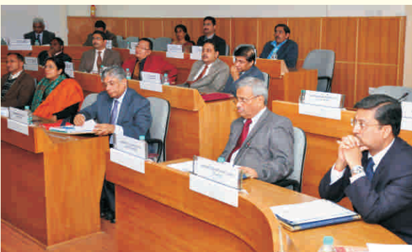
Senior officers of the DAD and IAAS participating in the seminar

A total of twenty two IDAS officers of senior and middle management level