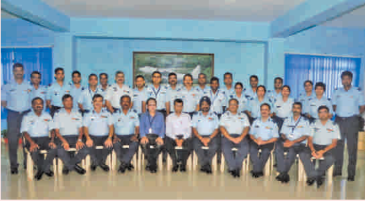
DFMC for Officers of the Western Air Command at Subroto Park, New Delhi