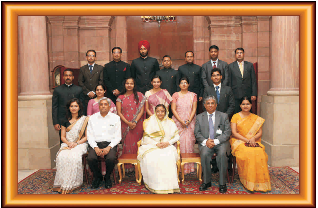
The First Citizen of the Nation alongwith IDAS Probationers Also seen : Shri Arvind Kaushal, IDAS, Addl. CGDA & Shri Navneet Verma, IDAS, Jt. CGDA (Training)