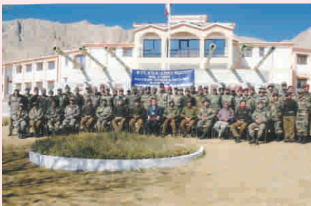
DFMC for Northern Command at Leh.

A Defence Financial Management Course for 40 Army Officers & 38 PBORs of Northern Command was conducted by