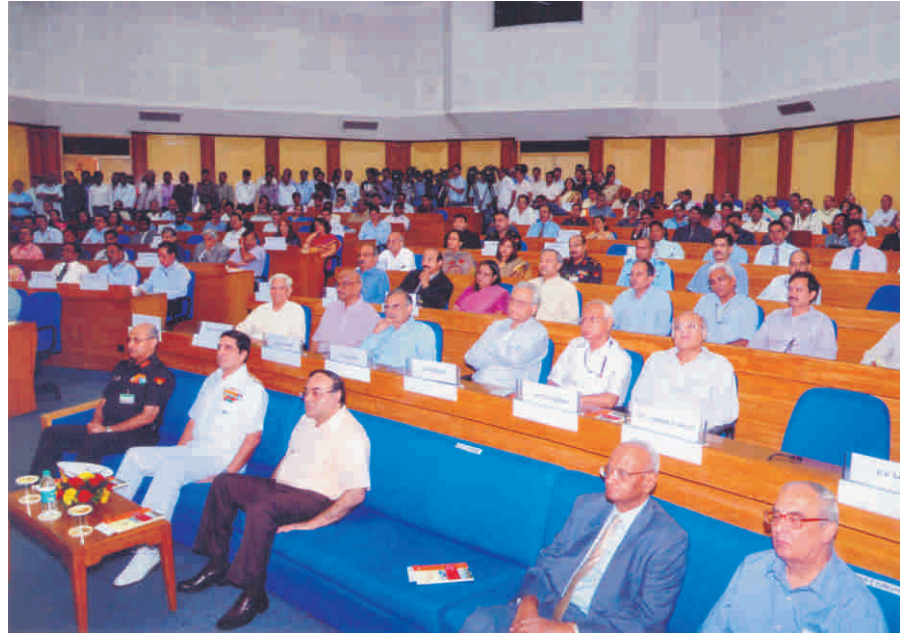
Dignitaries attending the DAD Day Celebrations 2012