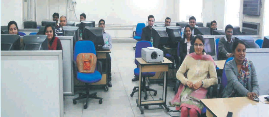
IDAS Probationers undergoing IT training at CENTRAD, Brar Square

The department has initiated certain e-projects in the past few months. One is the CMP (Cash Management Product) of SBI which will be a Web portal that will act as a Payment Gateway for the Department. It will enable seamless and uniform e-payments for all our offices from a centralised platform. The pilot implementation began at PCDA(CC), Lucknow on 19th December, 2012.