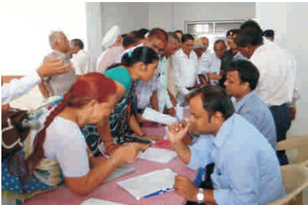
A helping hand in the autumn of their lives : Pensioners discussing their queries with the officials at DPA Lucknow

Defence Pension Adalat has proved to be a very popular and effective platform for redressal of pensioners' grievances. These Adalats provide face-to-face interaction across the table between the officers from the pension sanctioning and disbursing agencies and the pensioners. During the Adalats, training is also imparted to the officials handling pension in the banks and other agencies. Since 1987, as many as 115 Adalats have been organized by the Department in all parts of the country. Last four Pension Adalats have been organized in Amritsar, Kangra, Lansdowne and Trivandrum during the month of September, October, November and December 2012 respectively. During these Adalats (except DPA Trivandrum ) a total of 1021 cases have been received of which 435 cases have already been settled, leaving a balance of 586 cases.