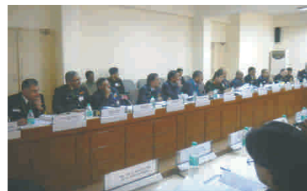
Third Apex Level Committee meeting at CENTRAD, Delhi Cantt in progress

The issues concerning implementation of MoD instructions regarding outsourcing of goods and services in Defence Sector were discussed and it was decided that broad guidelines regarding outsourcing could be issued by Service HQrs in consultation with CGDA. During the meeting the representative from DGAFMS