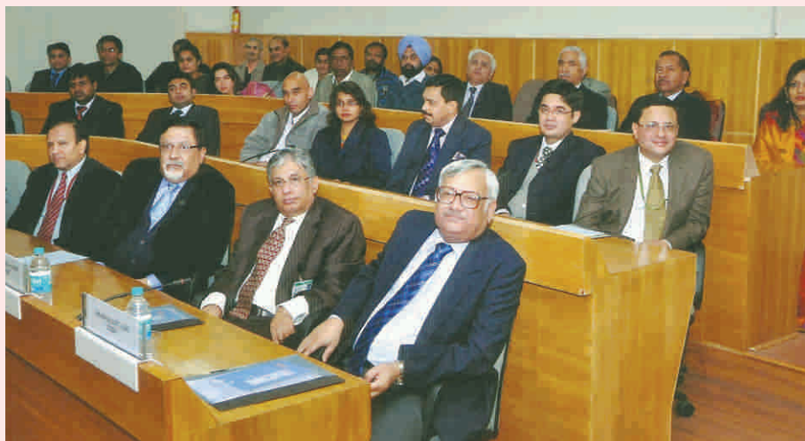
Senior officers attending the lecture

Till late 80's, PPO were issued manually duly typed by the Pension Sanctioning Agencies. In the year 1985, a computerized system in COBOL was developed for generating PPOs. Keeping in view the limitations of COBOL system, the Department has developed a new web enabled Pension Sanction system in PHP/My SQL, which has been launched by the Hon'ble Defence Minister on 1st October, 2012, on the occasion of the 265th Foundation Day of the Department. The proposed system is scheduled for implementation from 1.1.2013 and will cater for all the three Pension Sanctioning Agencies uniformly.