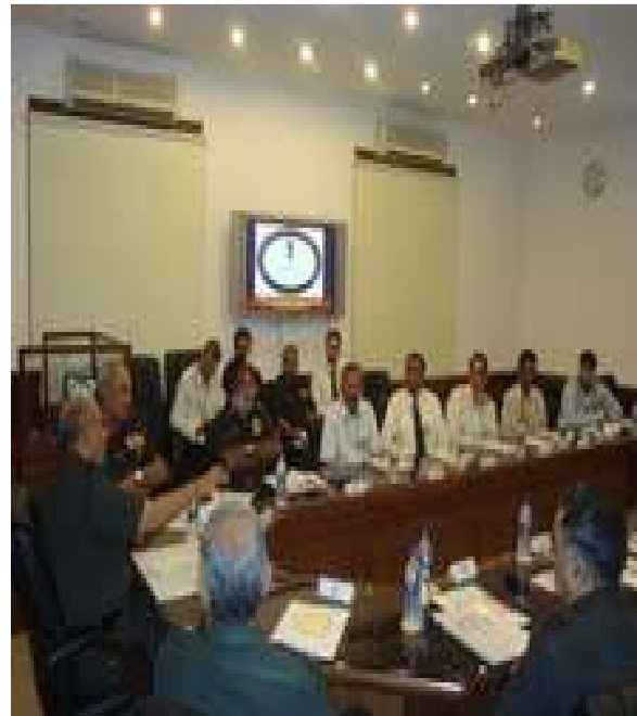
(Delegates attending the Conference)

Welcoming the participants the VCOAS expressed satisfaction over evolution of the forum as an interface between CFAs and IFAs. He expressed confidence that such interaction between CFAs and IFAs is an effective way to ensure good communication between SHQ and the Finance Wing.