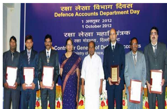
Raksha Mantri Award Winners with Hon'ble RM

The Defence Minister also launched two IT projects developed in-house by the Department, namely 'Pension Sanction Project' and 'Project SUGAM'. On this occasion Raksha Mantri awards for excellence were also presented by Mr Antony to selected employees for their outstanding contribution during 2011-12.