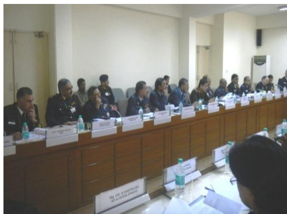
Apex Level Committee Meeting on IFA System in Progress