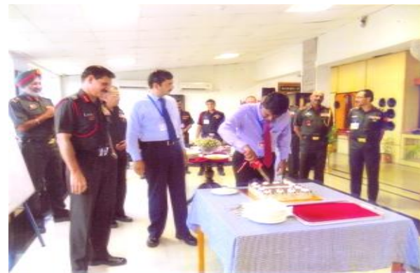
Party Time : IFA (EC) and Officers of HQrs Eastern Command on the occasion of DAD Day

"Focus on a few key objectives ... I only have three things to do.