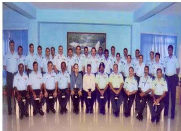
Participants of Training Programme at HQrs WAC